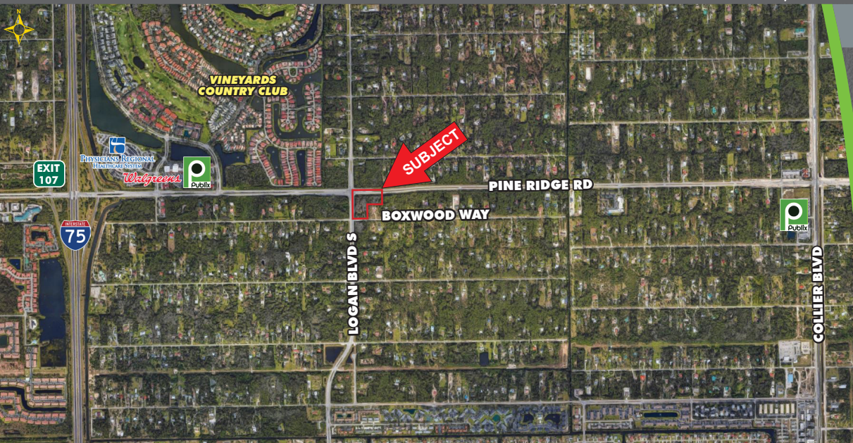
LOT 1 | PINE RIDGE RD & LOGAN BLVD S