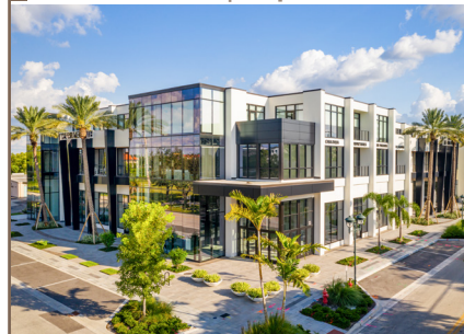
111 10th Street S | Naples