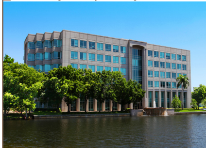
University Park | Fort Myers