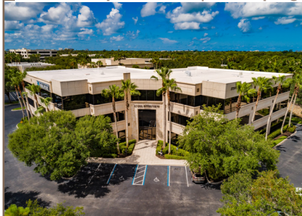
Riverview Corporate Center | Bonita Springs