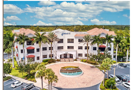
9530 Marketplace Road | Fort Myers