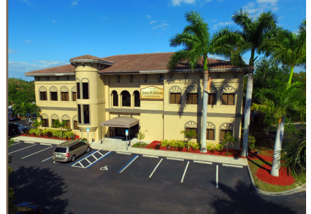
26969 S Tamiami Trail | Bonita Springs