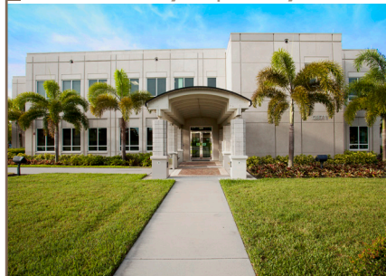
12871 University Dr | Fort Myers