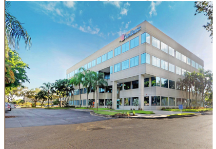
4415 Metro Pkwy | Fort Myers