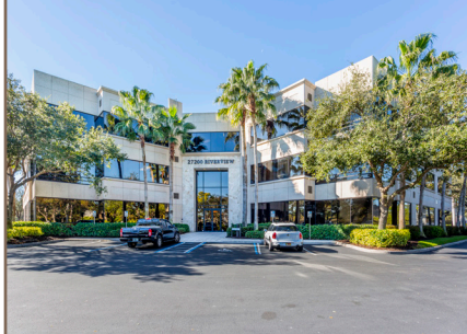
AIG Portfolio | Bonita Springs & Fort Myers

Below please find a number of our teams' recent deals and office listings for your review.