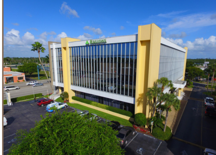
1100 5th Ave S | Naples