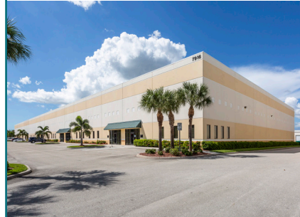
SWFL Business Center | Fort Myers