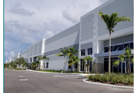
Meridian Center | Fort Myers