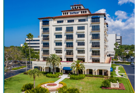
SunTrust Building | Naples