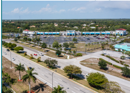
Bonita Commons | Bonita Springs