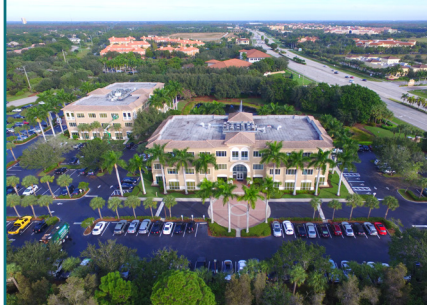
Walden Center | Bonita Springs

Below please find a number of properties that showcases our teams' experience.