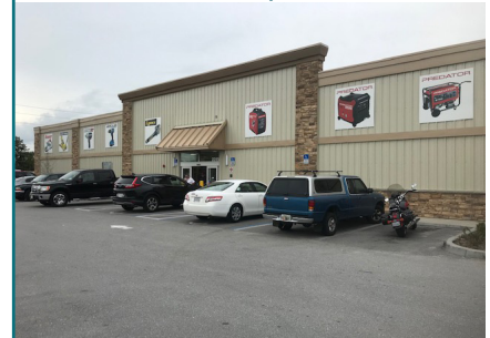
2315 Tamiami Trail | Port Charlotte