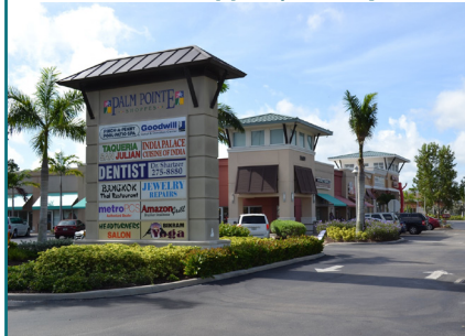
Palm Pointe Shoppes | Fort Myers