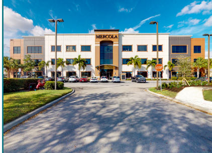
Mid Cape Corporate Center | Cape Coral