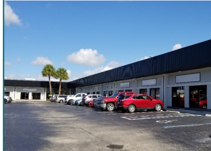
Metro Commerce Center | Fort Myers